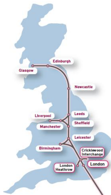
Figure 3.3: 2M Route Development Proposals

The 2M group is an alliance of local authorities concerned about the environmental impact of the Heathrow expansion proposals. 2M consider that the Government is overstating the benefits of aviation and fail to measure the full environmental costs. 2M propose that instead of a third runway, the Government develop a high speed rail network linking London with Heathrow, Birmingham, Liverpool and Scotland to the North. The line would extend north from London and serve Leicester, Nottingham, Sheffield, Leeds, Newcastle, Edinburgh and Glasgow. There would also be spurs to Birmingham (from Leicester), Manchester and Liverpool (from Sheffield). Figure 3.3 illustrates the proposed route alignment. The rail link will also join up with HS1 to open up routes to major city destinations in mainland Europe.